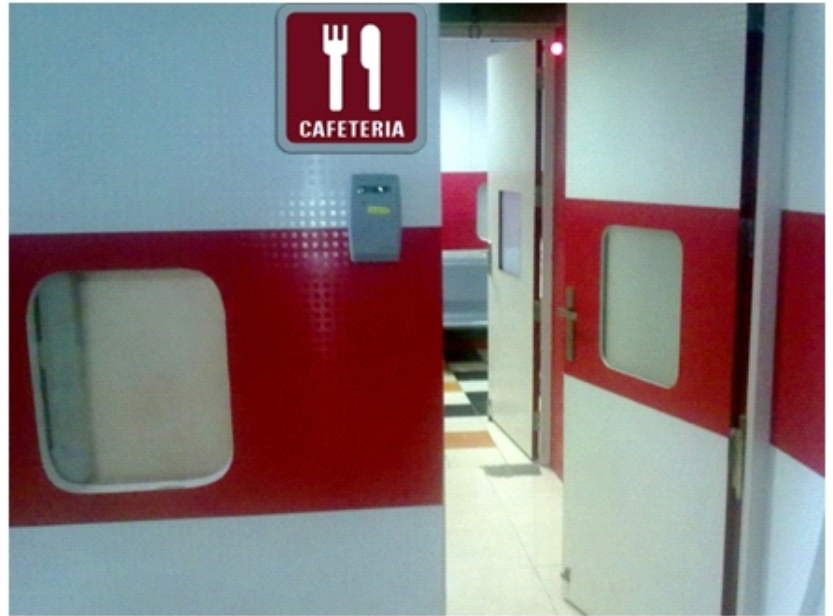
Usage of Cafeteria / Mess will be recorded in machines